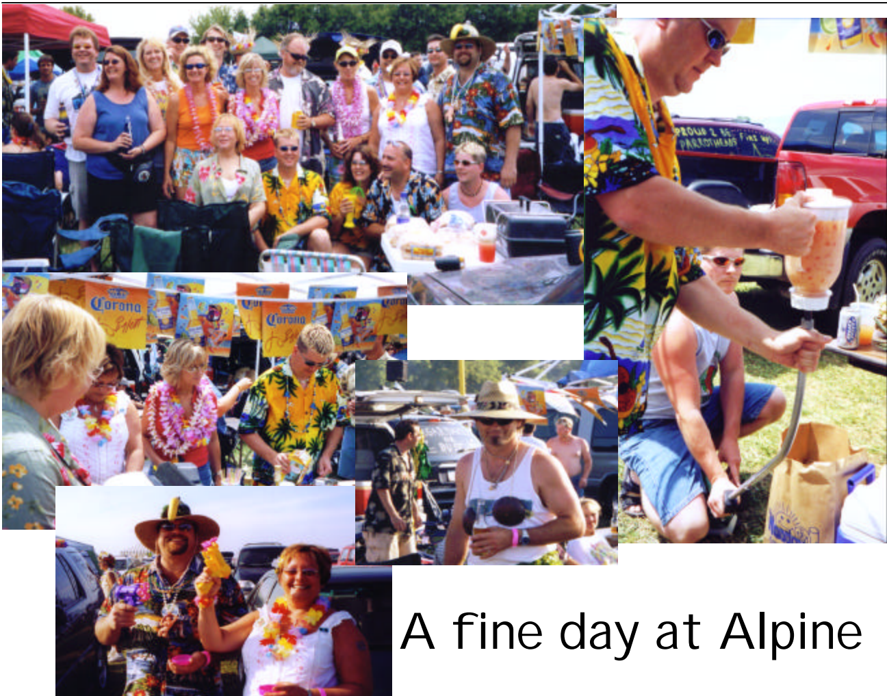
A fine day at Alpine